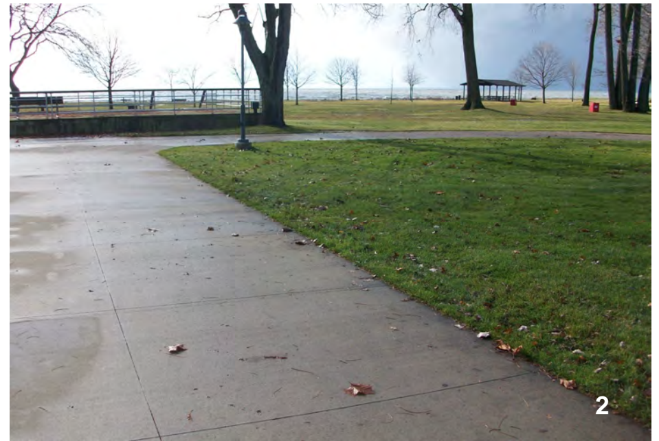
The extended walkway and proposed asphalt trail will connect this walk, the boardwalk, and the picnic shelter in the distance.