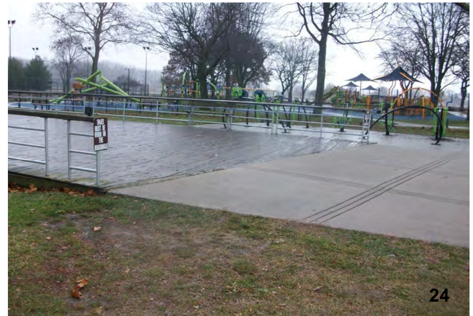
The east end of the boardwalk will remain flush with the existing concrete pavement. The boardwalk shall be designed for maintenance vehicle access.