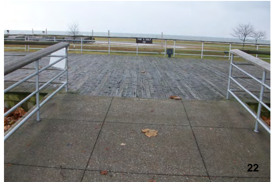
A stairway shall be added opposite this ramp providing improved access to the turf and waterfront.