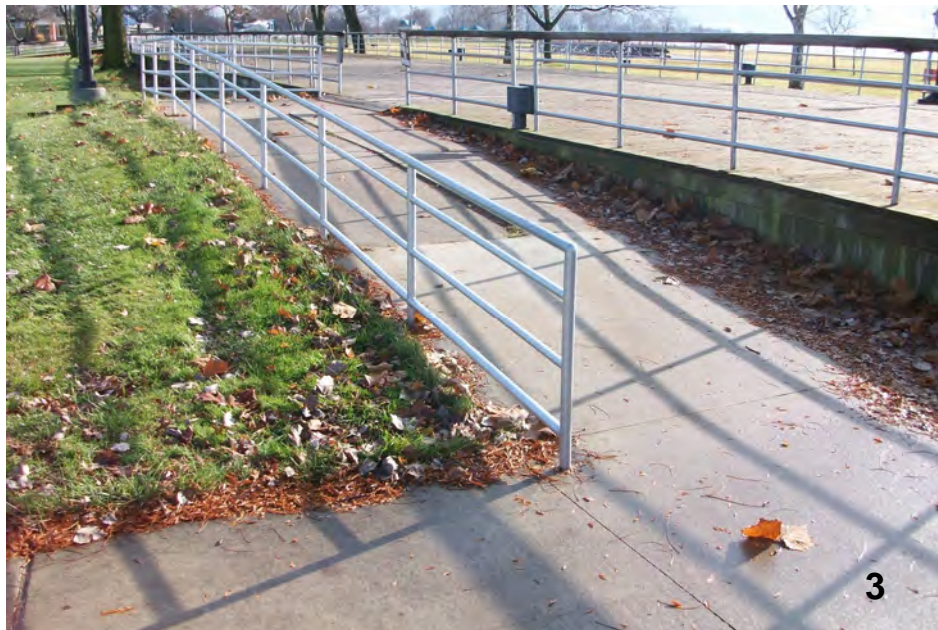
This ramp section with handrail will be removed. The renovated boardwalk will ramp down meeting the extended concrete walk.