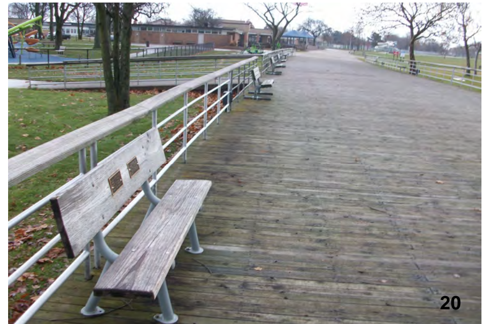
Existing benches to be removed. Seating options are proposed with adjacent companion wheelchair spaces. Universal accessible boardwalk tables shall have seating on both ends.