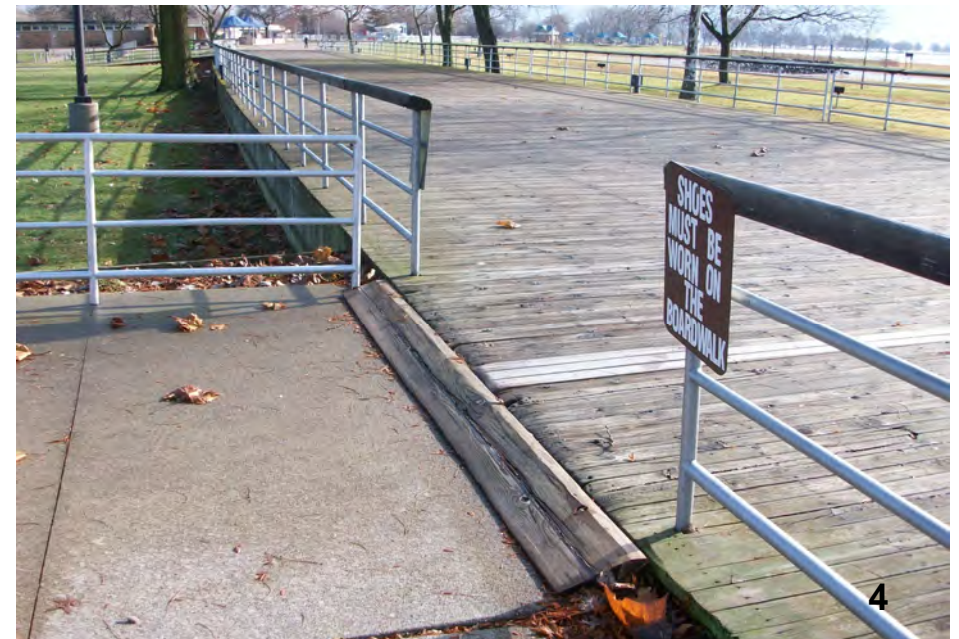
View of boardwalk looking east. The ramp connection to the boardwalk will be removed.