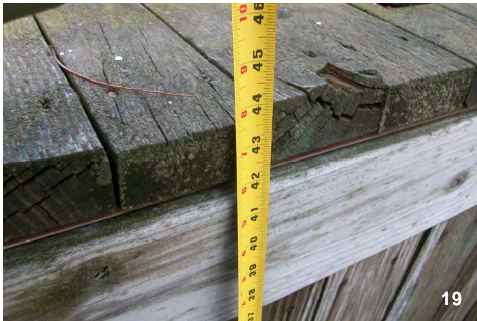
Boardwalk height varies. Deck heights above 30" require guardrails. Guardrail design to be determined. Integral railing lighting is being considered as an alternate to solar lights.