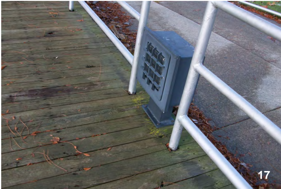
The existing boardwalk lighting shall be removed and will be replaced with solar edge lighting.