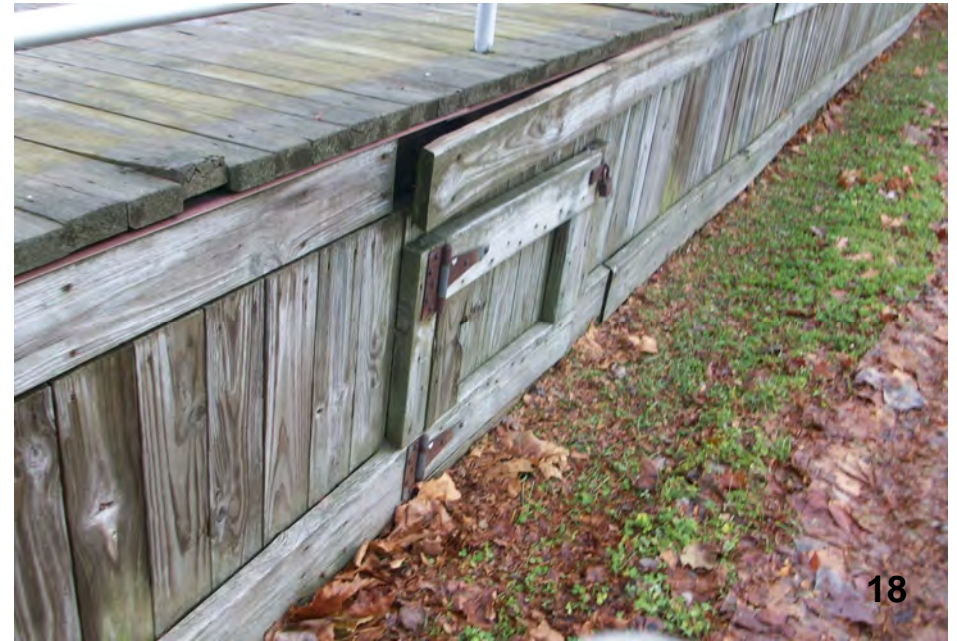
Boardwalk decking and side skirting design to be determined. The existing boardwalk piles shall remain and be built upon.