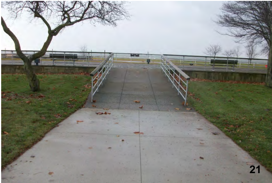
The existing ramp railings shall be removed. A walk with a reduced 5% maximum slope (7.8% existing) is proposed.