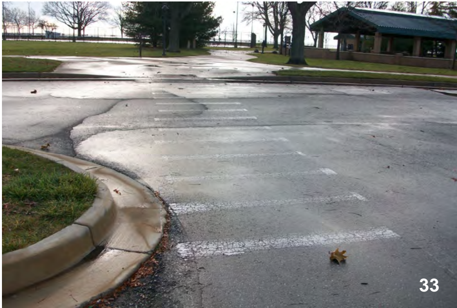
Striped cross walks, ramps, and accessible routes currently exist to the project site from multiple accessible parking locations.

“A” lot has 314 parking spaces requiring eight ADA Spaces. Eight accessible parking spaces provided.