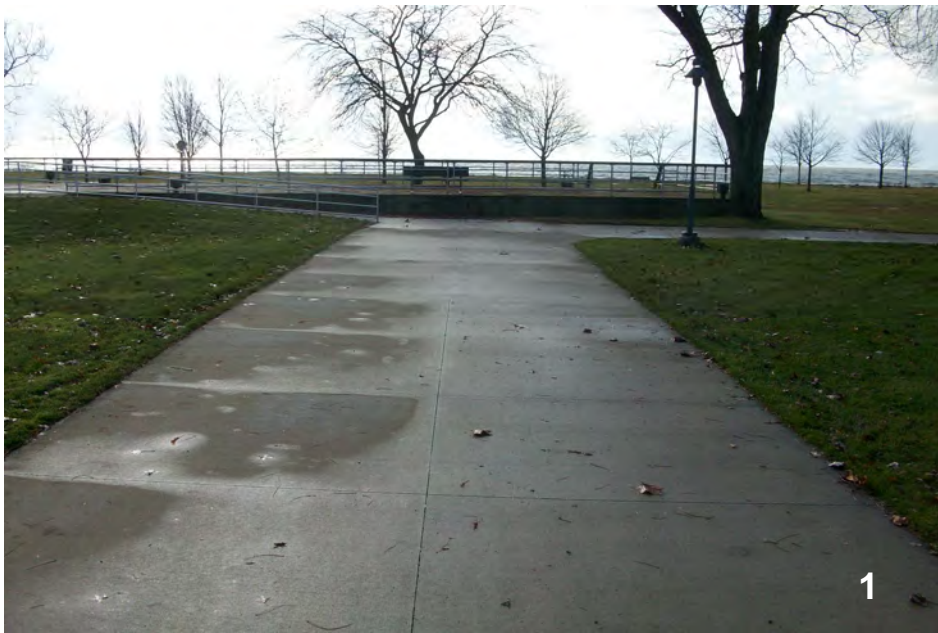
A portion of the existing boardwalk shall be removed allowing this walkway to be extended towards an accessible picnic area.