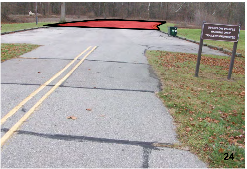
Pavement will be removed at the existing visitor parking lot. Eleven spaces to remain. Two of the spaces will be signed and striped for van accessible parking. Entire lot to be restriped.