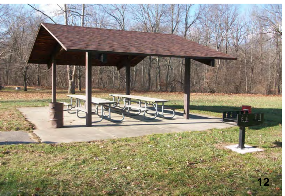
Existing shelter to remain. Six universal picnic tables are proposed along with a large universal accessible swivel grill on new concrete pavement. Electrical to be added at the shelter.