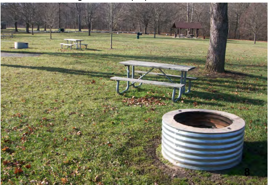
Universal accessible picnic tables with seating options on both ends will be purchased to replace the existing tables. Three new fire rings will be needed for the 3 additional campsites.