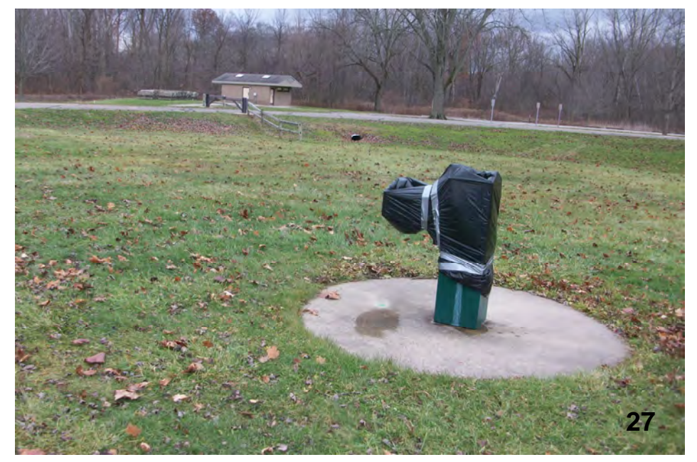
The existing drinking fountain and concrete pad near the Tulip Tree picnic area will be removed. A new fountain / water bottle filling station will be attached to the restroom building beyond.