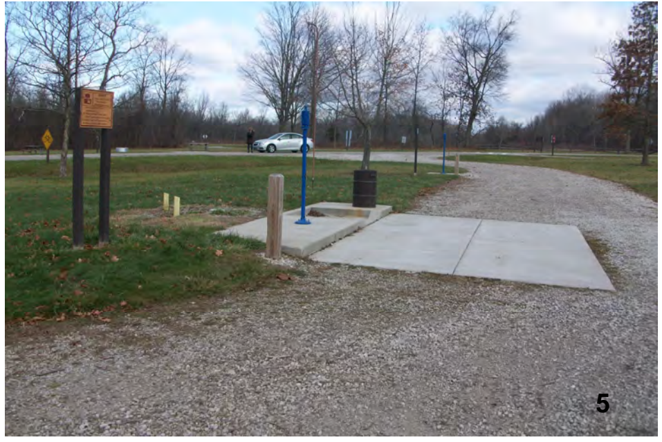
Existing sanitary dump station and potable water station.