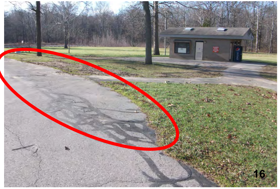
A 10 minute parking area will be signed and striped near the accessible restroom building.