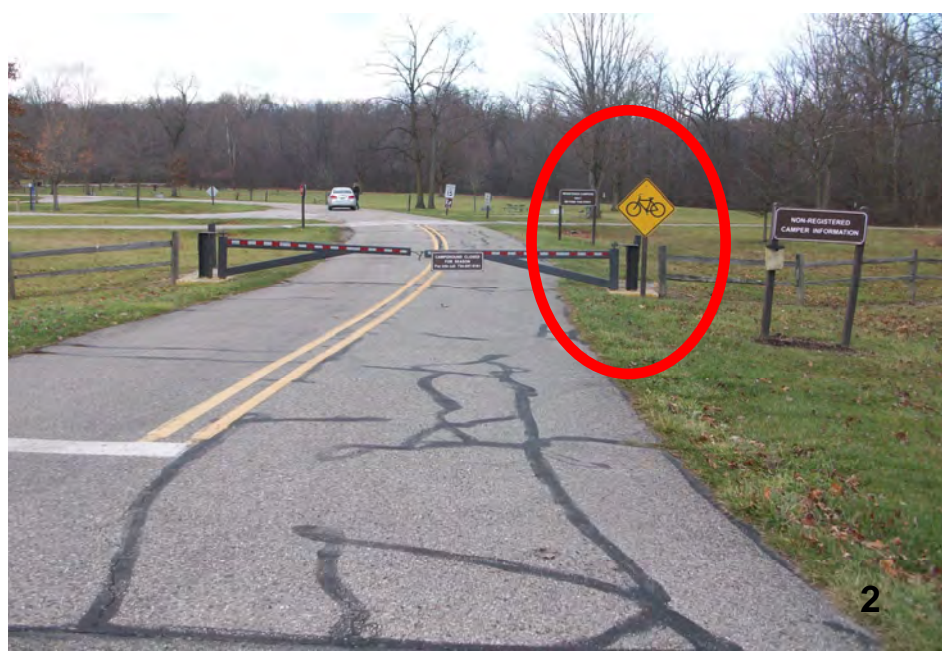
Campground entrance drive. Pedestrian crossing signs for the Iron Belle Trail to be replaced.