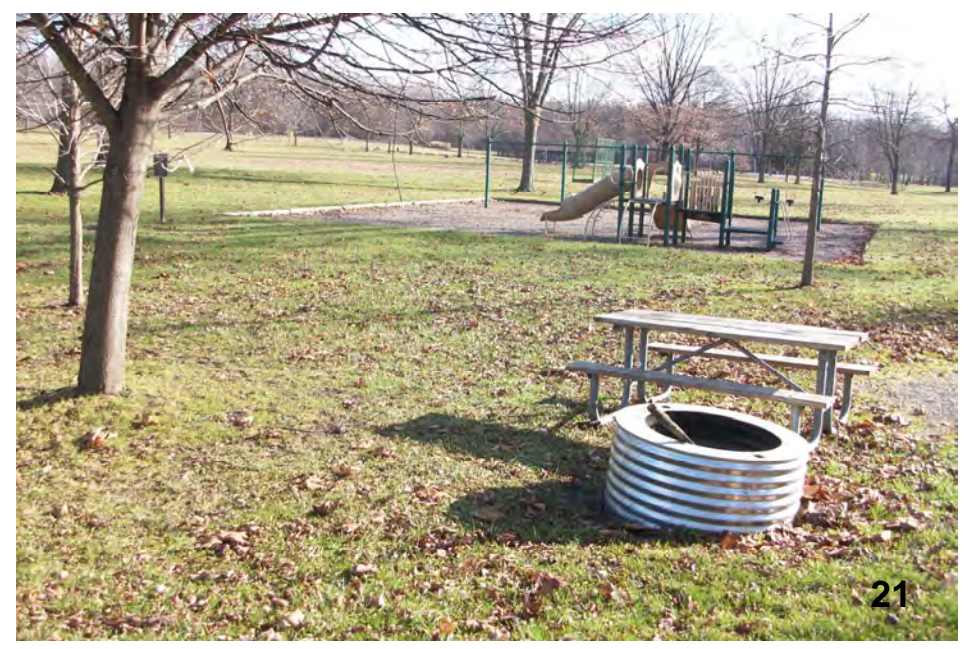
A new concrete walk is proposed to the existing playground and to 2 universal accessible picnic units with a table and grill.