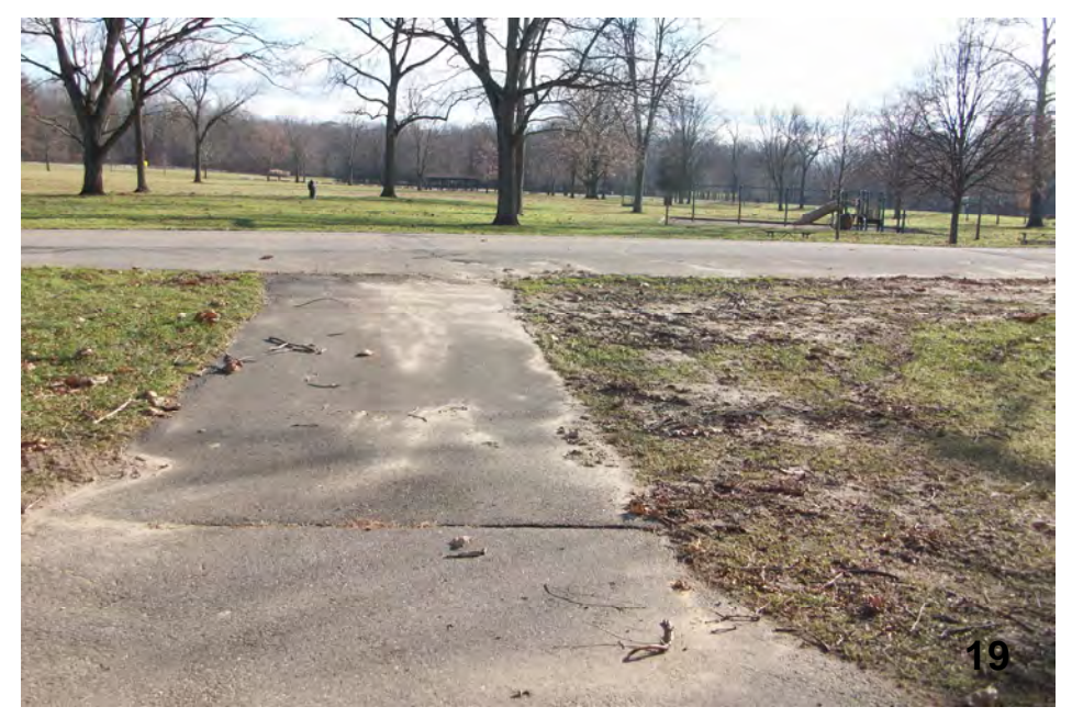
A signed and striped cross walk is proposed at the end of this walk. A new concrete walk will extend beyond to the playground and 2 universal accessible picnic units.