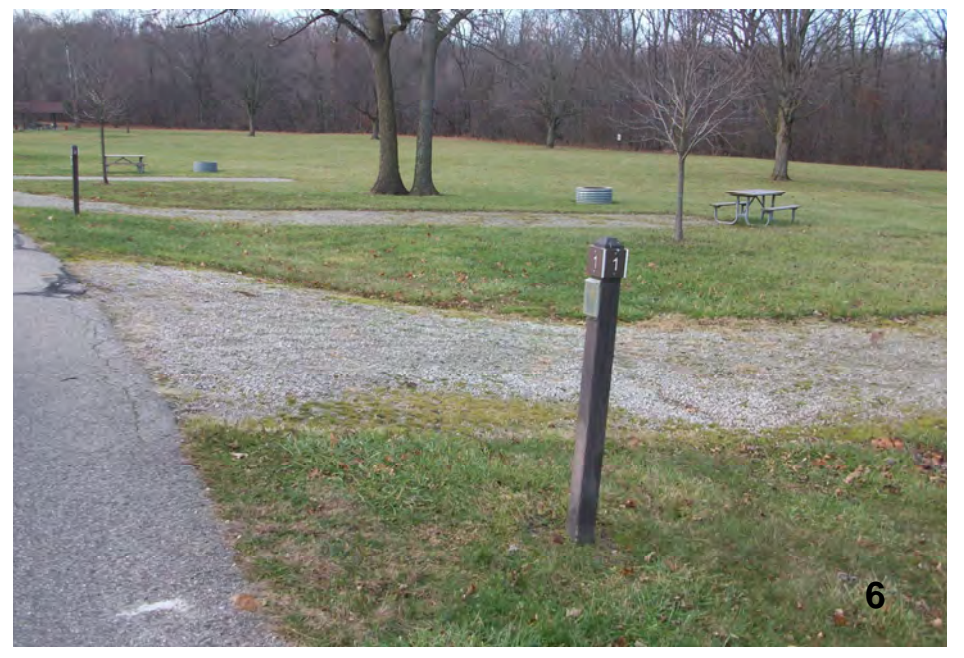
Existing campsites. Culverts to be added at existing sites 1-7. Culverts for existing swales are proposed at 13 sites total.