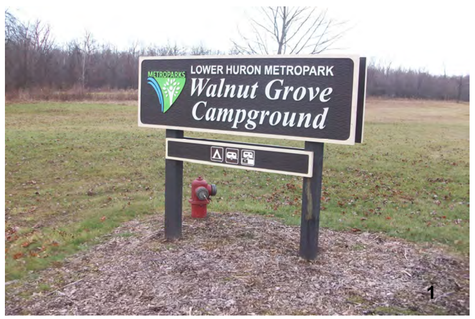
Walnut Grove Campground entrance signs.