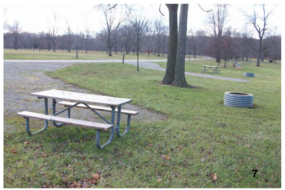
Sites 1-7 will be lengthened for longer RVs. Seven sites will be updated to universal design standards with large concrete pads. Site amenities at accessible sites will be placed on concrete.