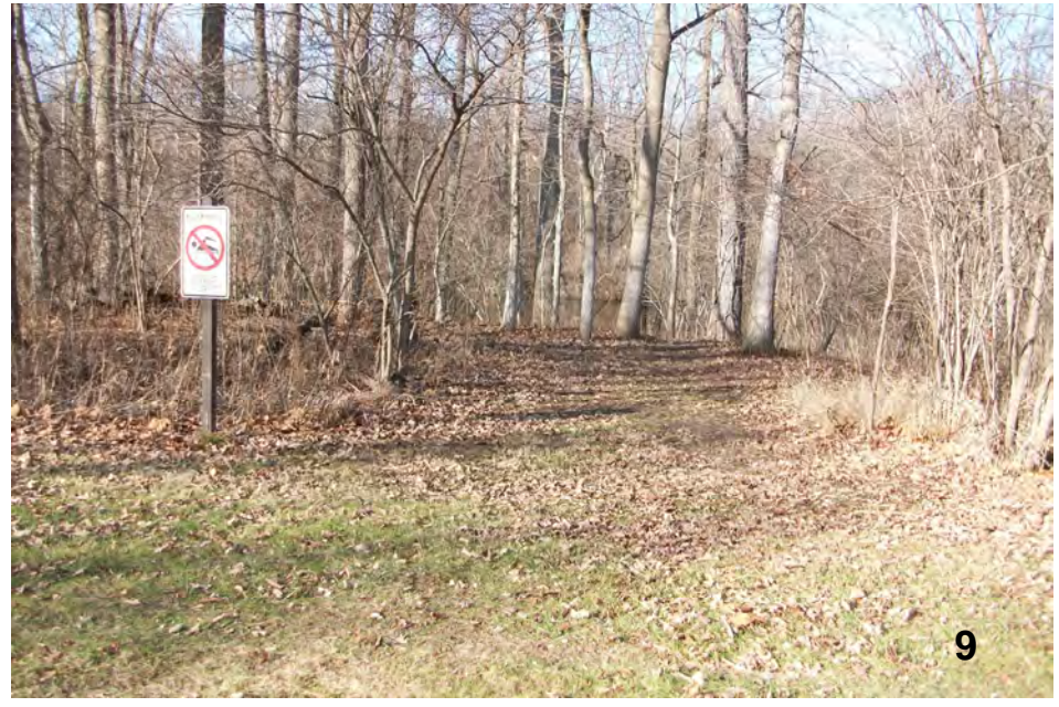
The Walnut Grove Campground provides camping opportunities for those paddling the Huron River National Water Trail.