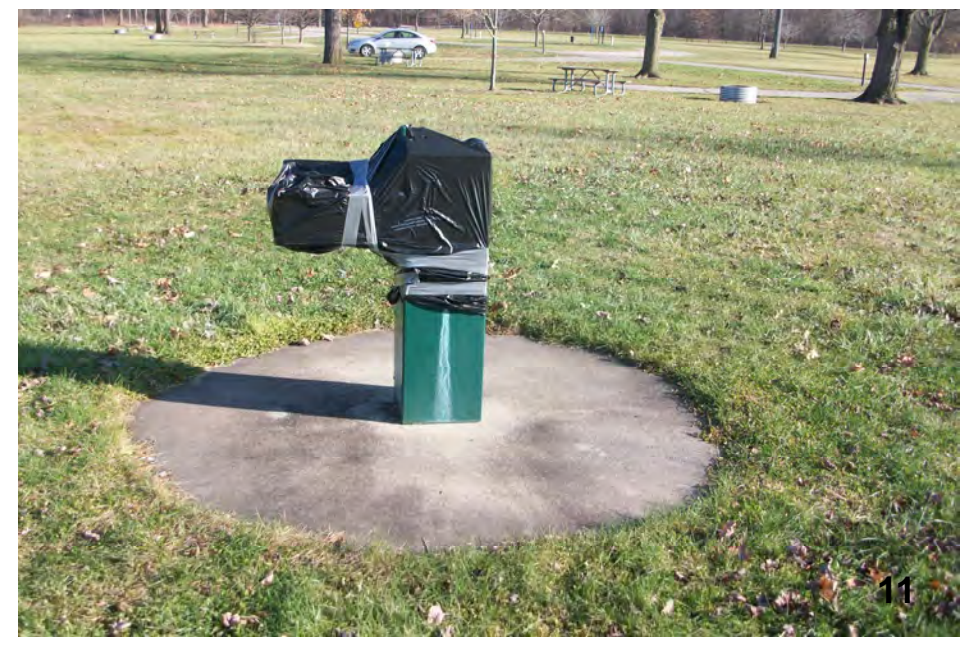
Existing drinking fountain and concrete pad to be removed. Two new universal accessible drinking fountains / water bottle filling stations are proposed in new locations at restroom buildings.