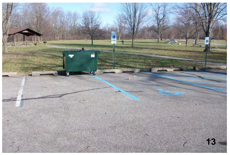
Existing dumpster to be moved adjacent to an accessible route. Parking lot striping and signs to be modified.