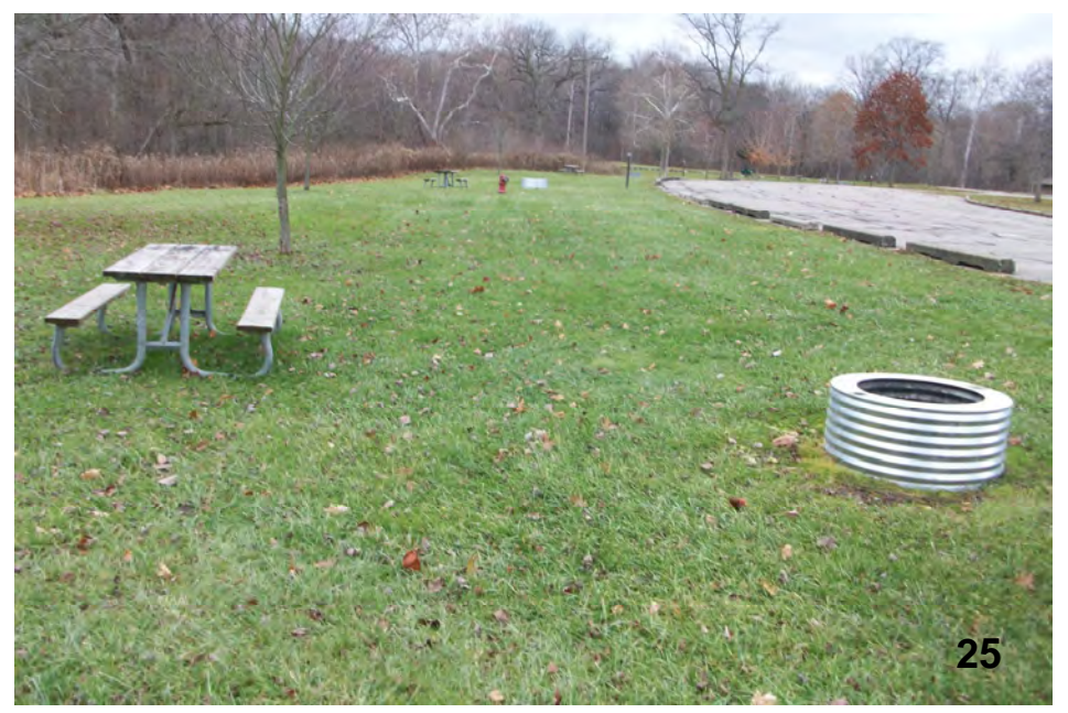
The fire pits at the removed RV camp sites will be relocated to new campsites. Thirteen RV sites are proposed.