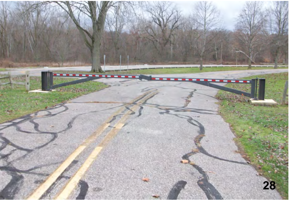
Existing gate separating the Tulip Tree picnic area and the Walnut Grove Campground. The drive aisle for the parking lot beyond will remain to help RVs turn around.