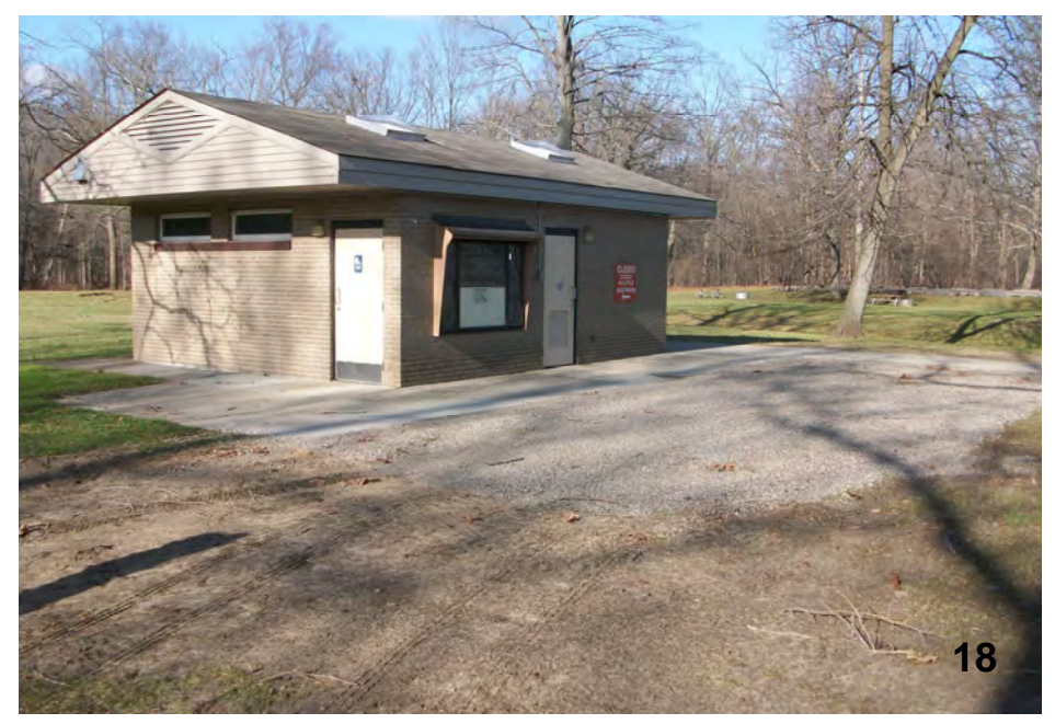
An accessible firewood storage unit, bench, and bike hoops shall be installed near the Walnut Grove restroom building.