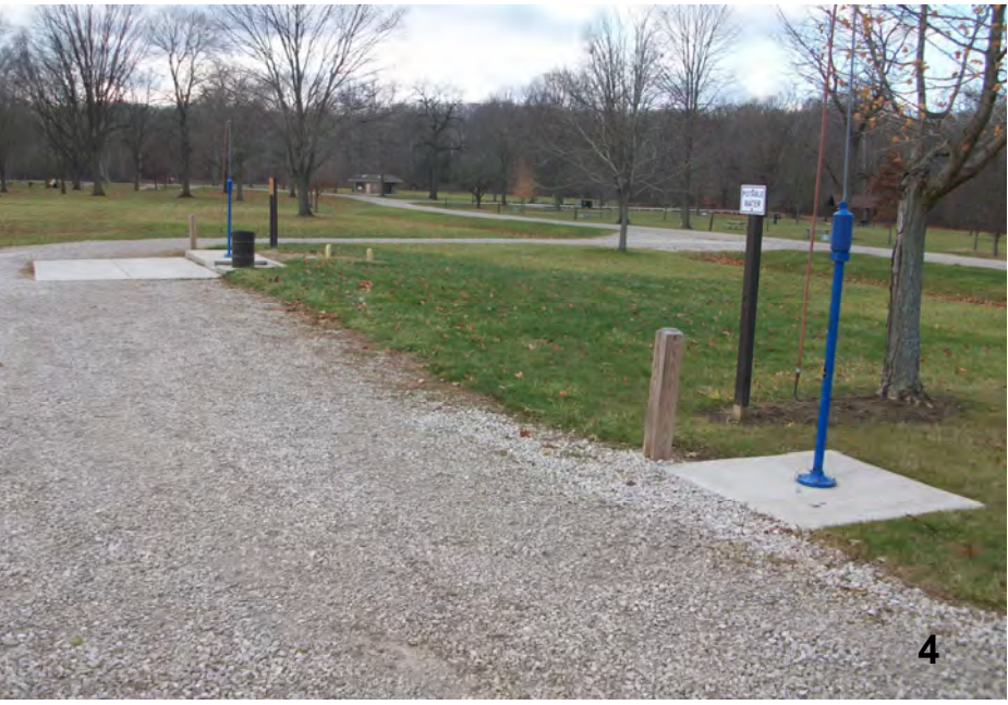
Existing potable water station and sanitary dump station.