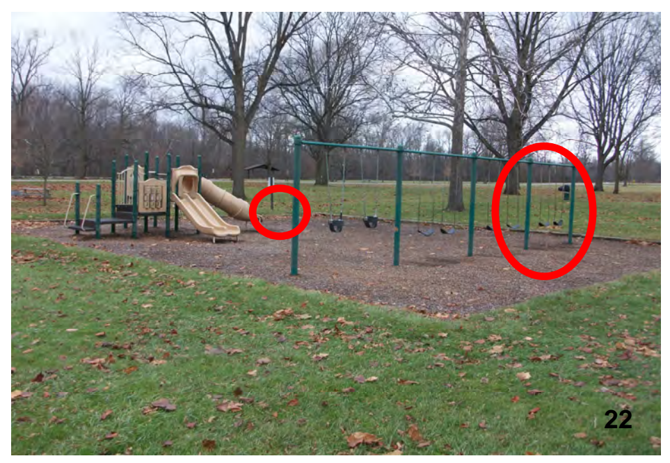
A concrete ramp into the mulched surface will be added. Two belt swings will be replaced with 2 ADA harness swings.