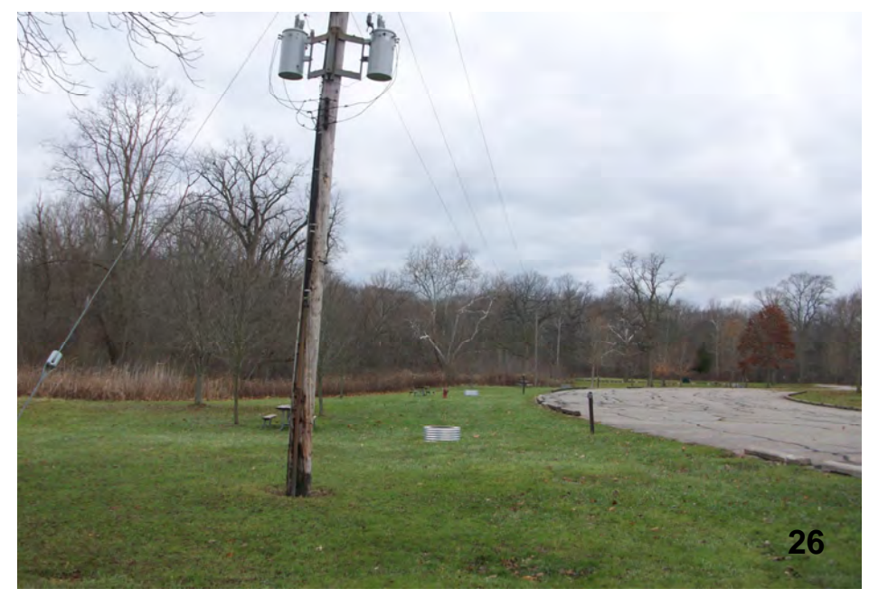
Three RV camp sites will be removed under utility line. Large sections of pavement will be removed from the adjacent lot.