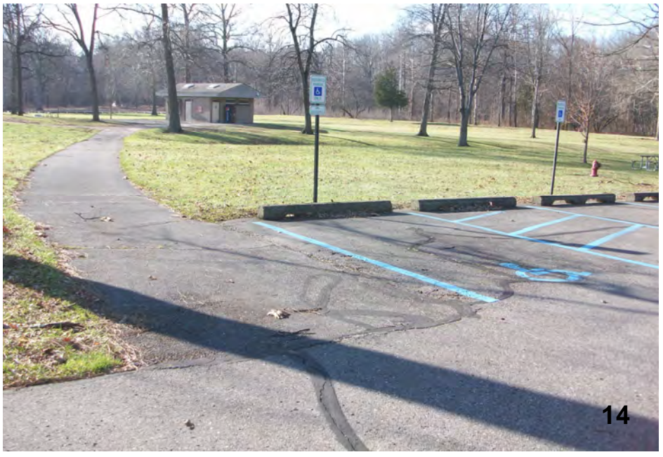
Existing van accessible spaces to remain.