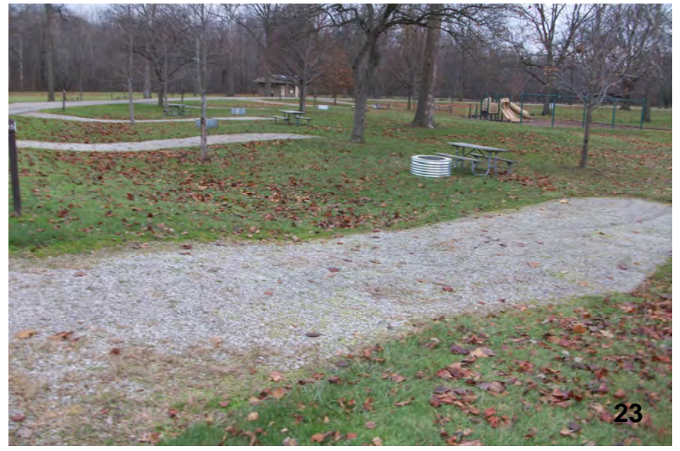
Existing camp sites near the playground to remain. New tables are proposed along with water and electric hookups.