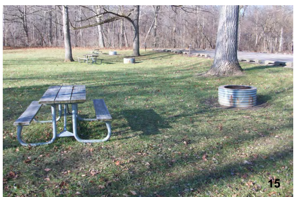
Existing tent camping sites to remain. Tables to be replaced with a universal accessible style throughout the campground. Water and electric hookups will be added at all 30 sites.