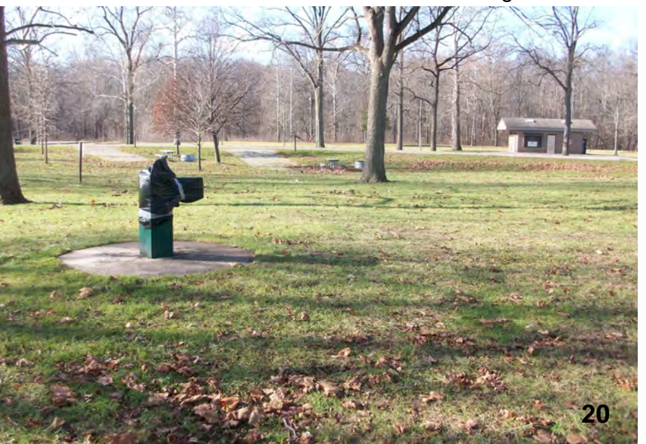
Existing drinking fountain to be removed. A new universal accessible drinking fountain / water bottle filling station to be mounted on the restroom building beyond.