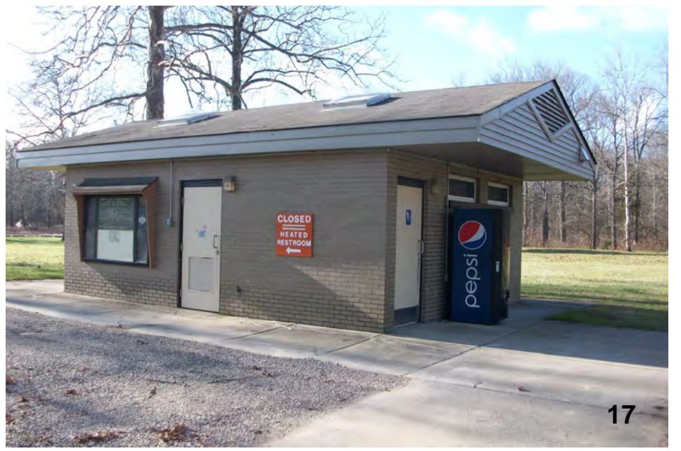
A universal accessible drinking fountain / water bottle filling station to be installed on the side of the restroom building.