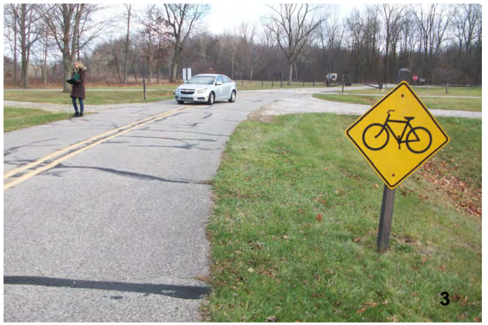
Pedestrian crossing signs for the Iron Belle Trail to be replaced.