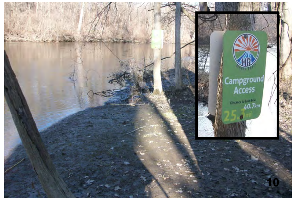
Existing launch / take-out area with water trail signs.