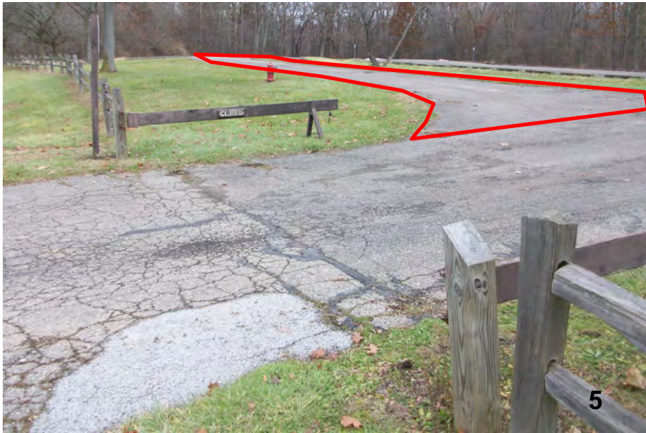
5 The north parking lot shall be removed and restored to turf. Approximately .4 acres will become a no mow area.