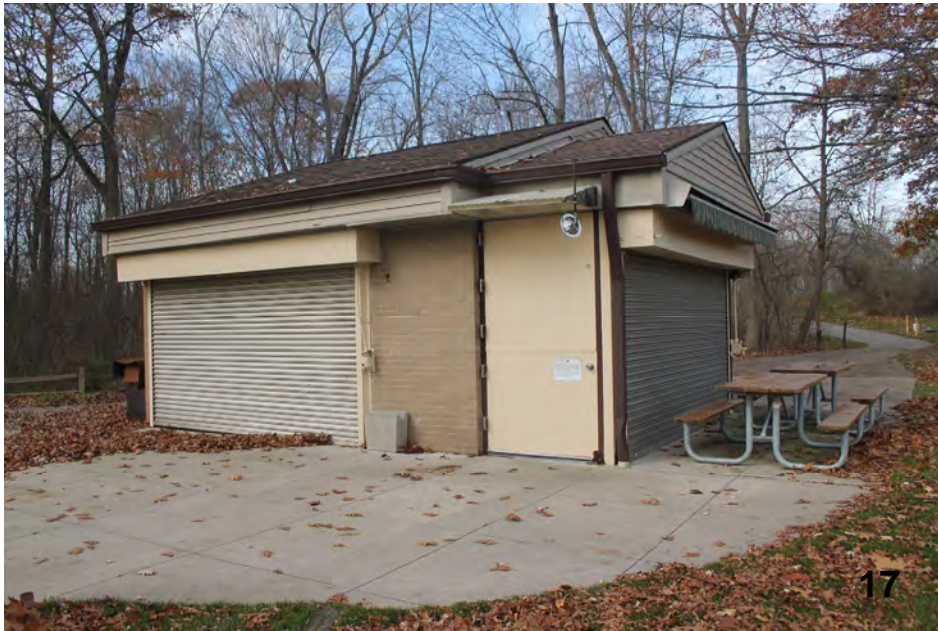
The existing restroom building, former golf starter building, will be removed along with the adjacent concrete pavement.