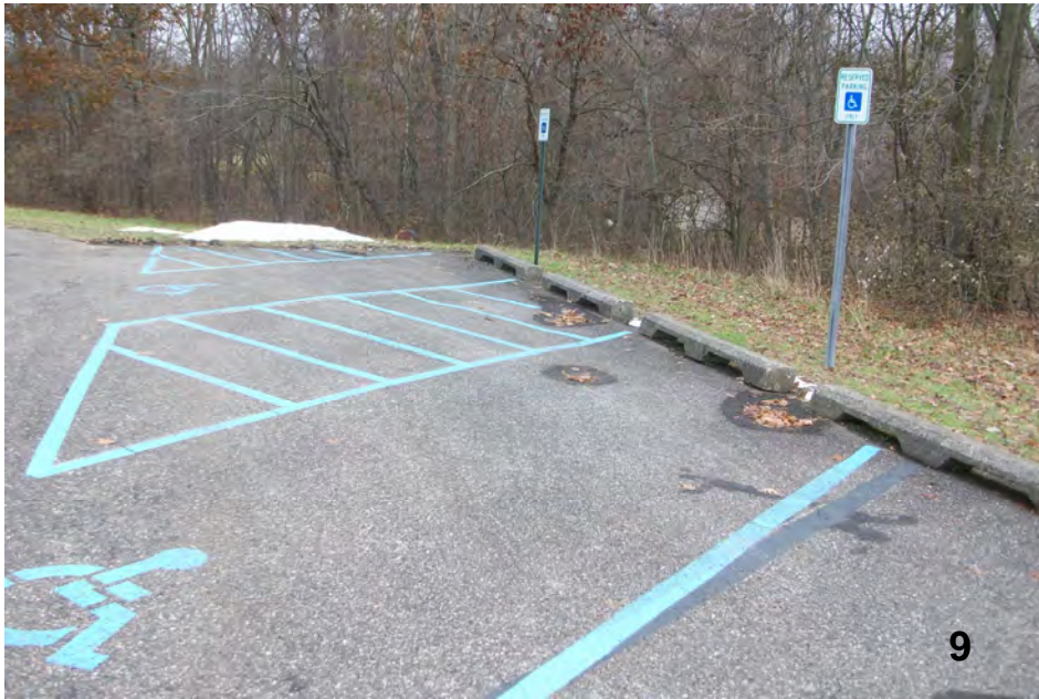
Existing accessible parking spaces. There are 4 total, one is van accessible. A new walk is proposed in front of these spaces.