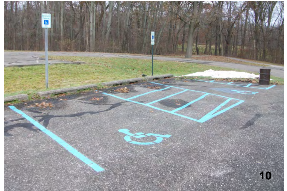
Existing spaces to be removed. New van accessible spaces shall be striped and signed adjacent to the others.