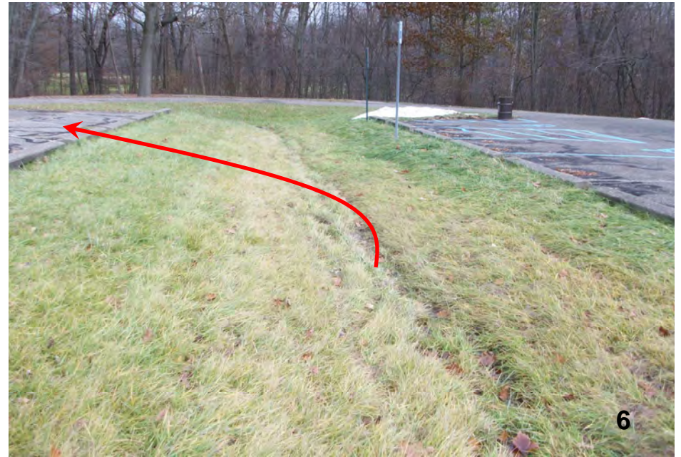
6 The existing ditch will be rerouted around the new turn around.