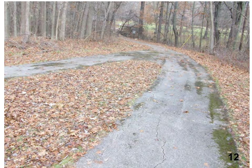
Both walks will be removed. Path on right to be realigned and constructed per universal design standards. A 6' wide concrete walk is proposed. Slopes currently exceed 5% after intersection.