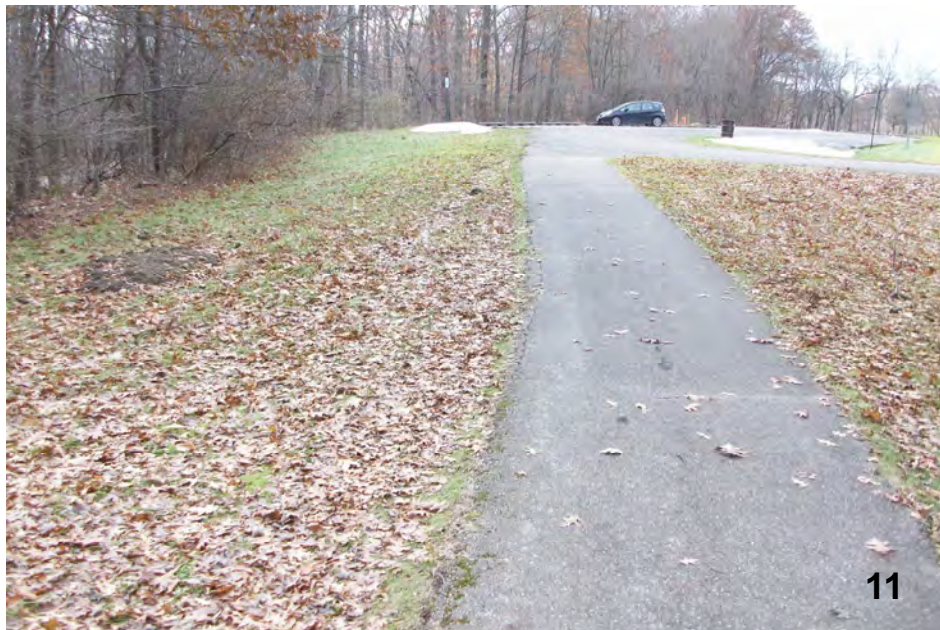
The existing walk shall be rerouted further to the left and extend in front of all of the proposed van accessible parking spaces.