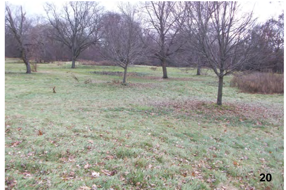
View from elevated bullpen area. Tree work is proposed within both field areas to make them safe and to improve visibility.