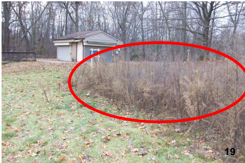
New concrete walk to be constructed to the bullpen area for the off-leash dog areas. Bullpen area is on an old putting green.