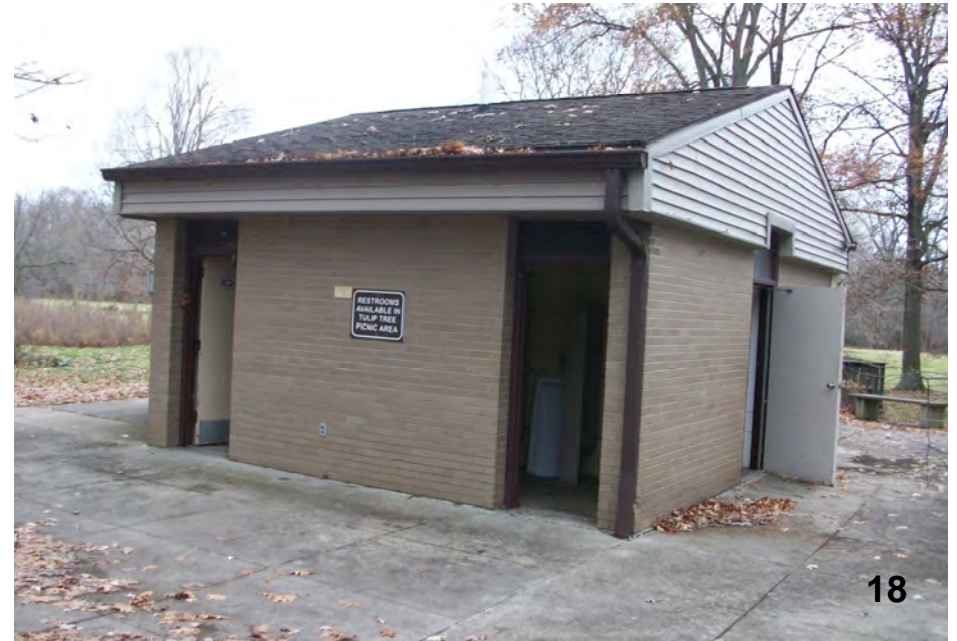
Restrooms are too small to make them accessible. A moveable accessible restroom building will be rented by the Metroparks.