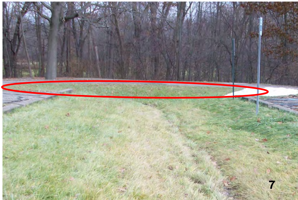
7 The existing catch basin in the middle of the turn-around will be removed / abandoned. The center circle will become a small retention area.