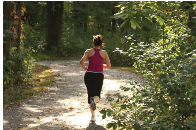
Figure 3.2 | Metroparks System