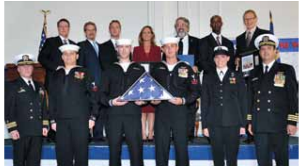
9/11 award – Navy Operational Support Center Detroit sailors stand with Huron-Clinton Metroparks staff following ceremonies during which the Metroparks and staff received awards in appreciation for events that honored first responders and the military on the 10 th anniversary of the September 11, 2001 terrorist attacks.