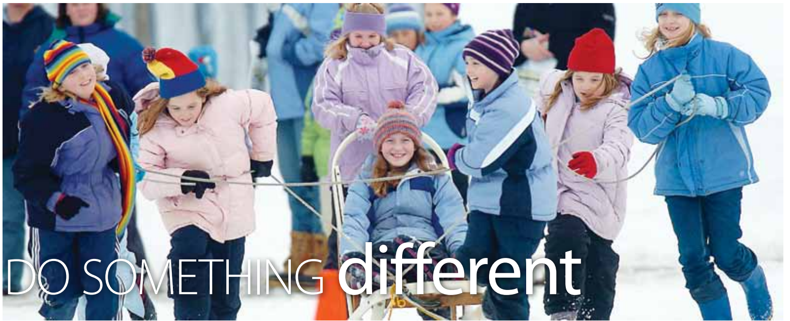
Chillin' at the Mills Winter Festival, Hudson Mills Metropark

Once the cold weather hits, don't stop moving! Colder temps and snow shouldn't mean hibernation for you and your family. There are all kinds of activities to try that not only keep away the winter blues but also offer new fun and exciting ways to utilize the Metroparks and all that they have to offer! So, take advantage of our winter-friendly facilities and events that make it easy to enjoy the outdoors while getting some exercise, too!