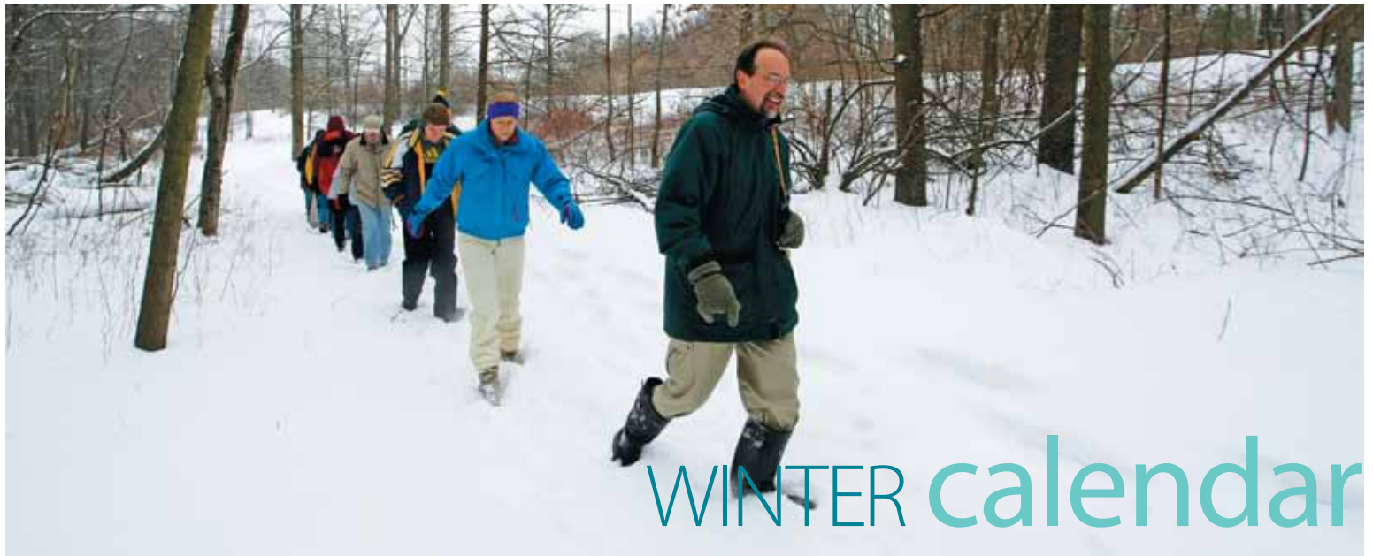
Pancake Walk, Stony Creek Metropark

KENSINGTON METROPARK PARK EVENTS near Milford/Brighton 800-477-3178 or 248-685-1561 Please preregister for programs