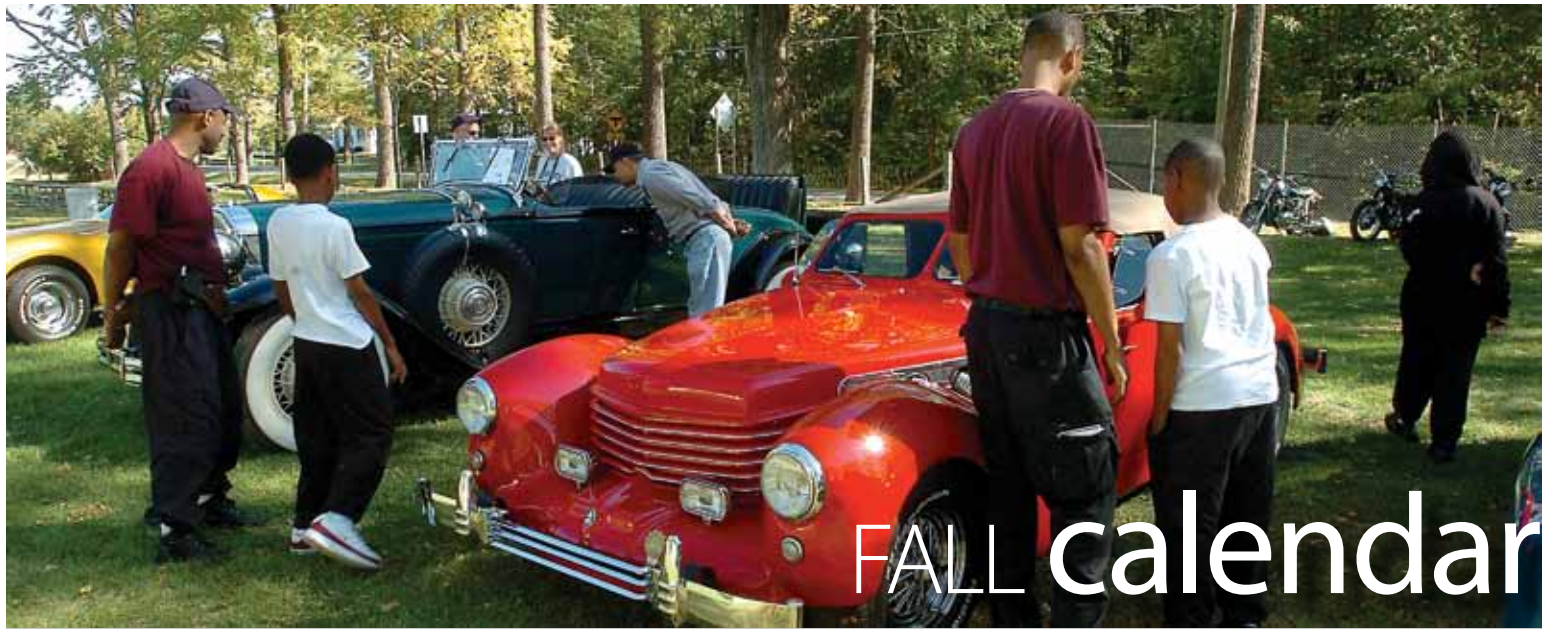
Antique Vehicle Show, Wolcott Mill Metropark

KENSINGTON METROPARK PARK EVENTS near Milford/Brighton 800-477-3178 or 248-685-1561 Please preregister for programs